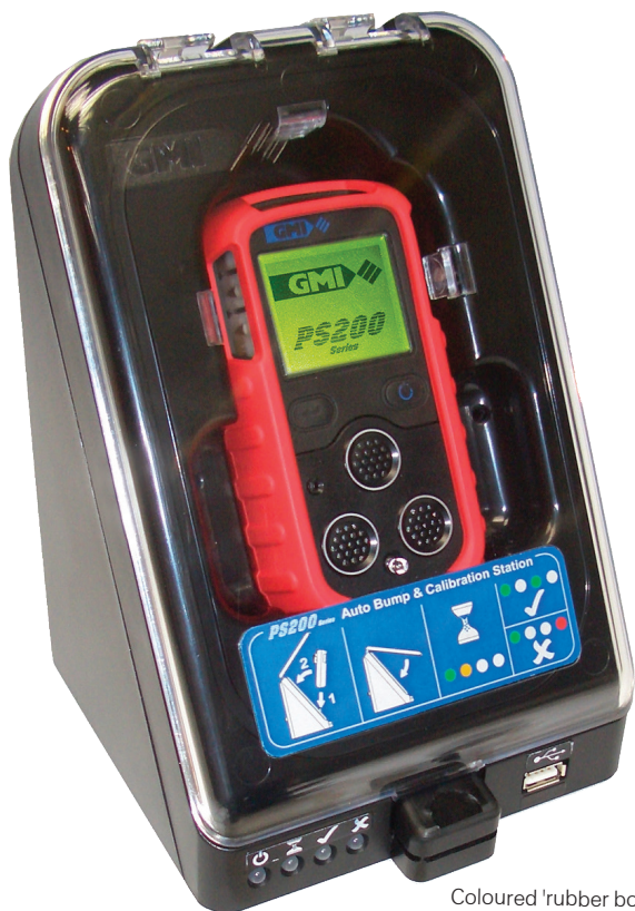
Coloured 'rubber boot' for multi-site or multi-application working (7 colours available)

To complement the Personal Surveyor product line, Tyco Gas & Flame Detection has developed a compact, robust and easy to use Auto Bump & Calibration Station that can provide full bump and calibration options. Data transfer is facilitated using a USB memory stick with Standalone software that is simple to set up and customise based on end users' specifications. Standalone, PC, and ethernet versions are available.