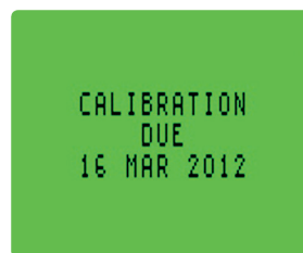
Configurable calibration options