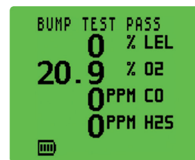
Configurable bump options