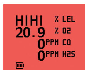
Red display in alarm conditions