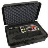
Confined Space Kit Part# CSK-XP *XP Included*