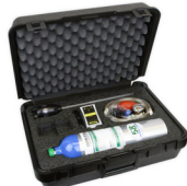
Confined Space Kit w/ Gas Part# CSK-XP-GAS *XP Included*