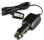
MGC Vehicle Charger Part# MGC-V-CHARGER1