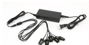
MGC Multi Charger Part# MGC-CHRG-MULTI