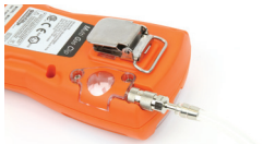
MGC Pump Quick Disconnect* Part# MGC-PUMP-QD